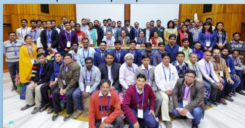
18 th outreach programme feedback session during IIRS User Interaction Meet (IUIIM)-2017

IIRS has conducted six workshops in 2007, 2009, 2010, 2013, 2014, 2015 and 2016 to take feedback from participating institutions to improve the quality of future courses.